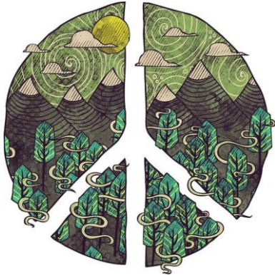
Illustration - Embellish a well-known symbol with your own creative details